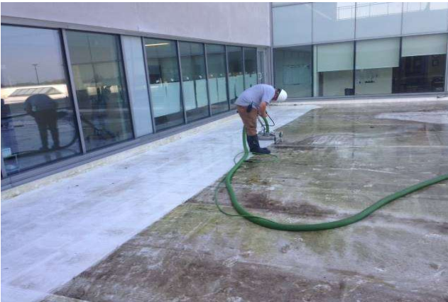
Another view of the roof being cleaned,