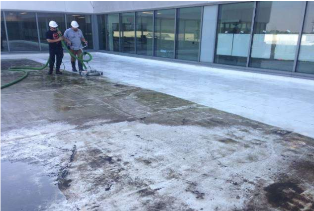
Overview of the roof in the process of being cleaned.