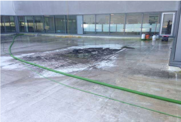
View of Roof 1.1 prior to being cleaned.