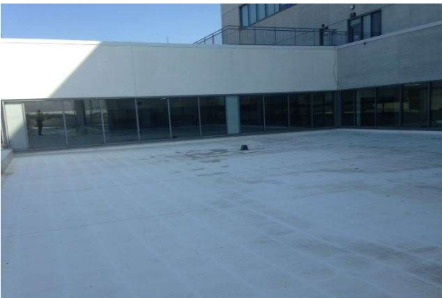
Overview of Roof 1.1 with the roof cleaning complete.